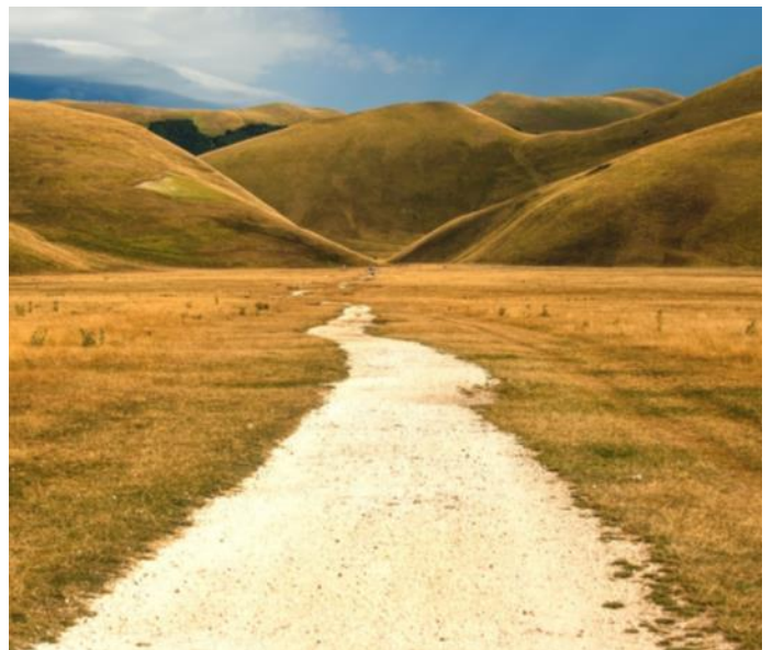
Thoughts in Solitude Thomas Merton

Therefore I will trust you always though I may seem to be lost and in the shadow of death. I will not fear, for you are ever with me, and you will never leave me to face my perils alone.